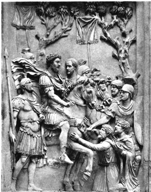
RECEIVING GERMAN PRISONERS IN THE FIELD. PANEL FROM TRIUMPHAL ARCH.